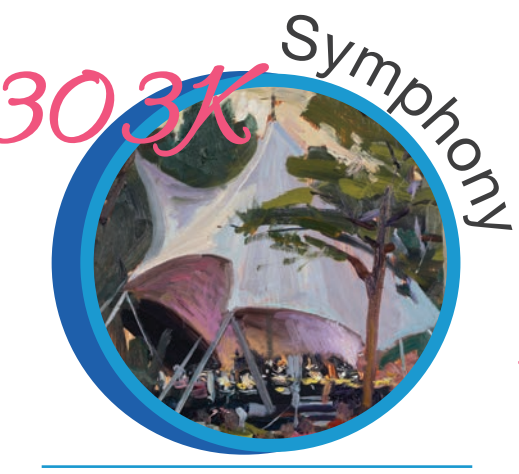
Annual Symphony Under the Stars Outdoor Free Family Concert